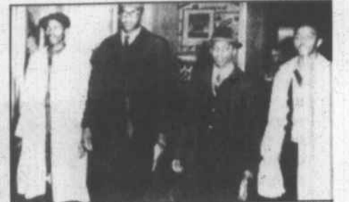
The A&T (or Greensboro) Four. Eugene McCain, Joseph Alfred McNeil and David Richmond Jr.

a reflection of the extraordinary action against social injustices that was demonstrated on Feb. 1, 1960, by four A&T freshmen - Ezell Blair Jr. (Jibreel Khazan), Franklin E. McCain, Joseph Alfred McNeil and David Richmond Jr.