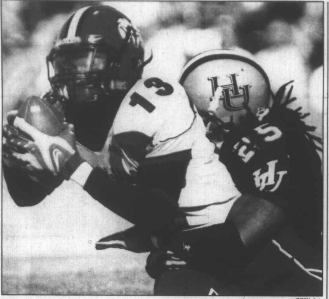
Winston-Salem State grabbed a huge win over Hampton over the weekend.