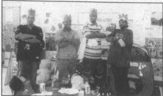
Dads and male mentors played a variety of roles at the school last week.