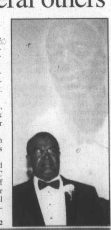
MERICAN EXPRESS ACCEPT