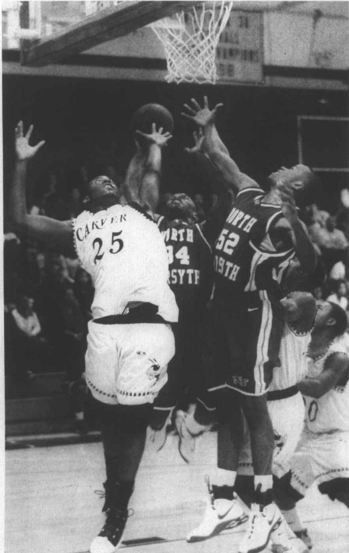
The basketball action is expected to be intense during the classic next week.

Crown Trophy will donate plaques to all the participating teams.