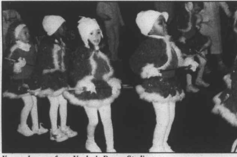
Young dancers from Vogler's Dance Studio.