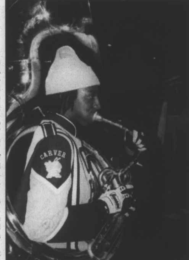
A tuba player performs with others from the Carver High School Marching Band.