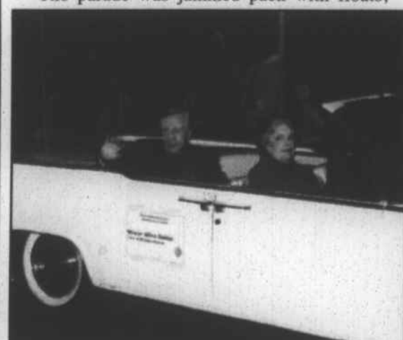
Mayor Allen Joines waves to the crowd.