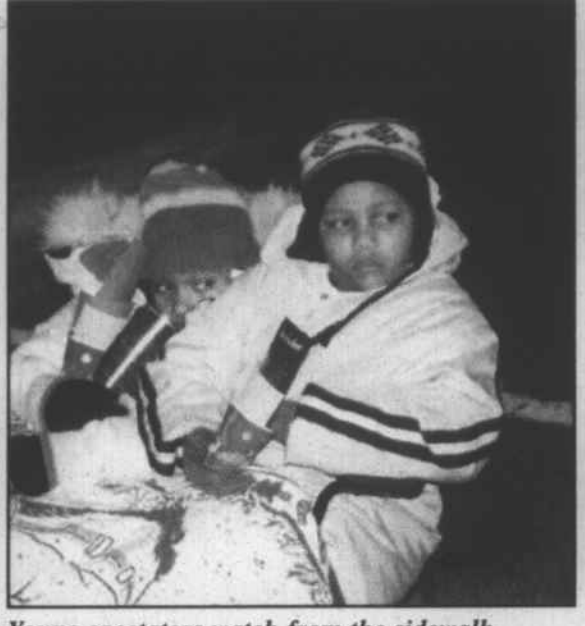
Young spectators watch from the sidewalk.