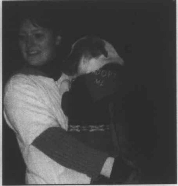
A woman carries dog from the Animal Adoption and Rescue Foundation (AARF).