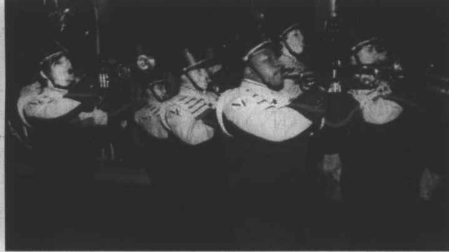
North Forsyth's Marching Band makes some noise.