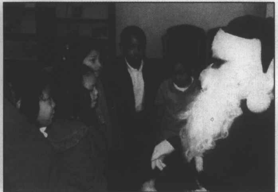
Curious kids ask Santa questions.