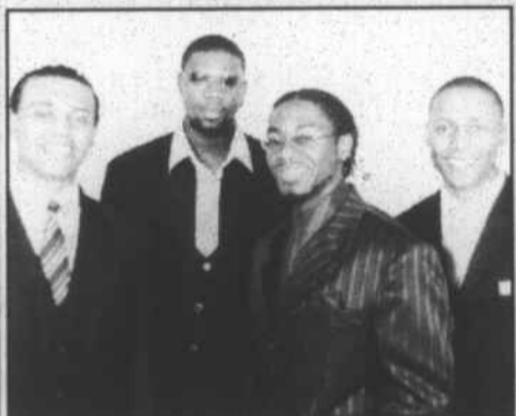
The Stars of Joy