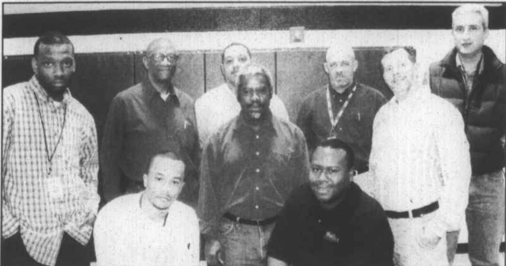
Some of the male staffers at the school that played a role.

An Adopt a Dad luncheon was the culminating event. It featured guest speaker was