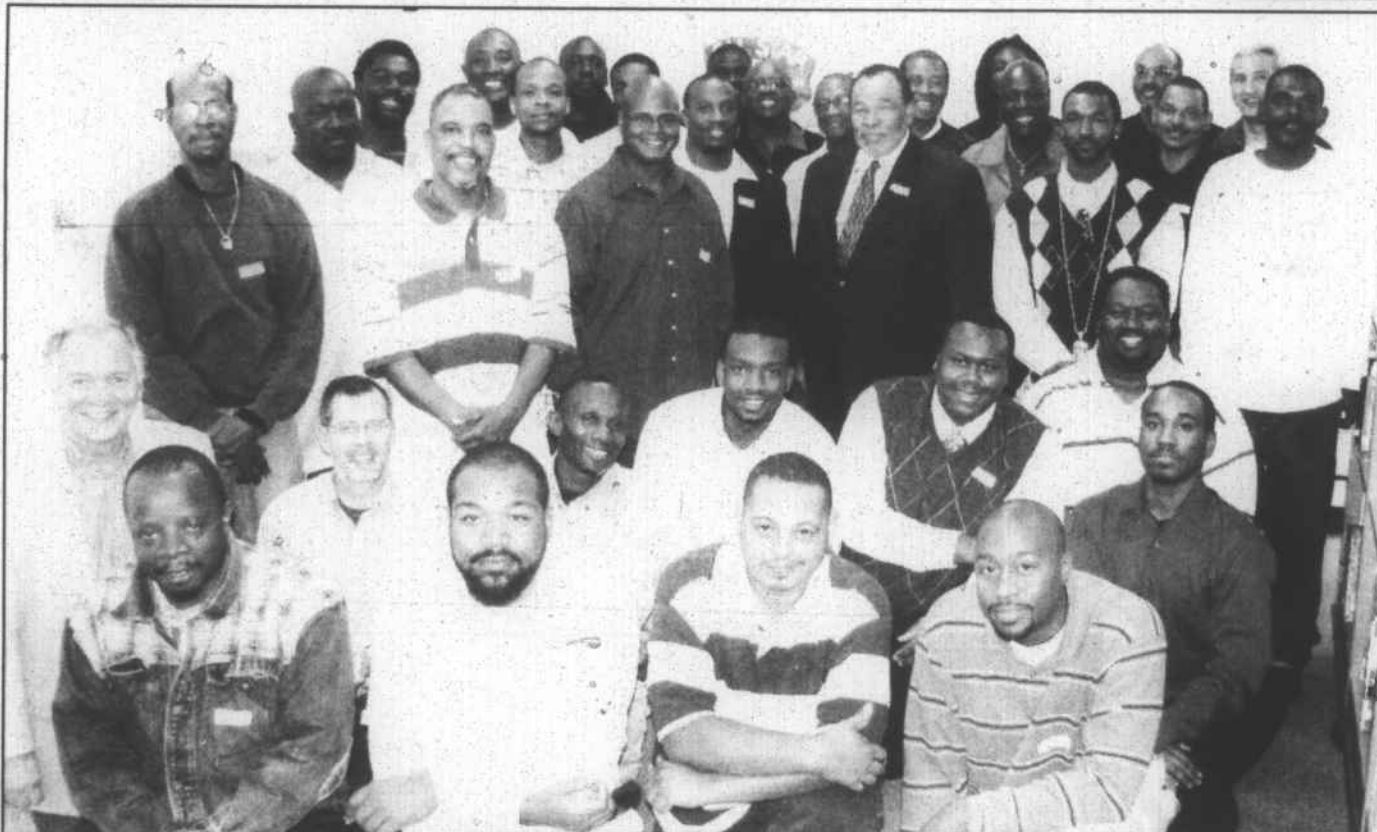
Some of the dads and other male role models that took part.