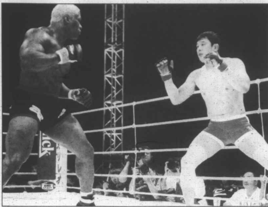
MMA matches are scheduled for next month at the Millennium Center.