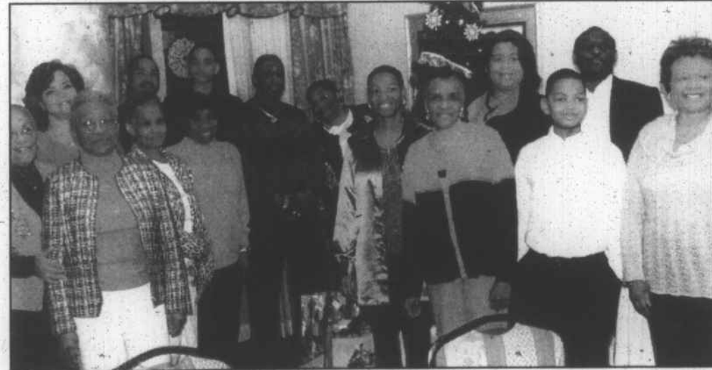
Hampton alumni and their families at the recent party.