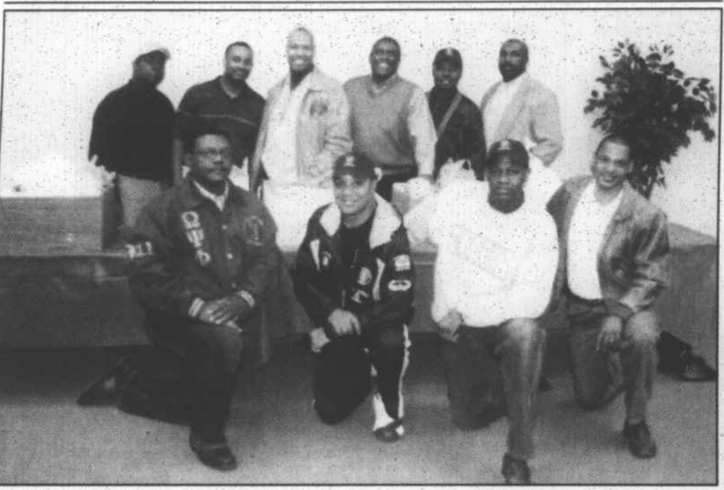
Members of the fraternity with some of the food they collected for the community.

ect was part of the Z-hope (Helping other people to excel) project.