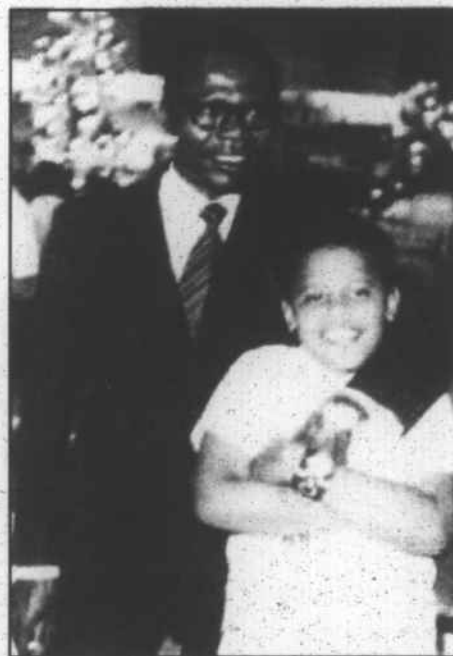
Barack Obama II with his father, the late Barack Sr.

I know you didn't do this just to win an election and I know you didn't do it for me. You did it because you understand the enormity of the task that lies ahead. For even as we celebrate tonight, we know the challenges that tomorrow will bring are the greatest of our lifetime – two wars, a planet in peril, the worst financial crisis in a century. Even as we stand here tonight, we know there are brave Americans waking up in the deserts of Iraq and the mountains of Afghanistan to risk their lives for us. There are mothers and fathers who will lie awake after their children fall asleep and wonder how they'll make the mortgage, or pay their doctor's bills, or save enough for college. There is new energy to harness and new jobs to be created; new schools to build