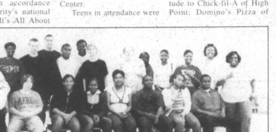
The Youth Symposium drew a healthy-sized crowd.

America) on April 18, Keep Winston Beautiful on May 16 and plans to host the annual Little Miss & Mr. Sigma Pageant.