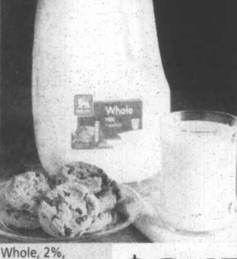
1% and Skim Food