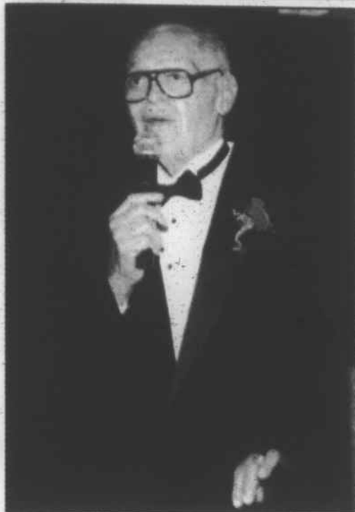
The legendary Clarence "Big House" Gaines died in 2005.