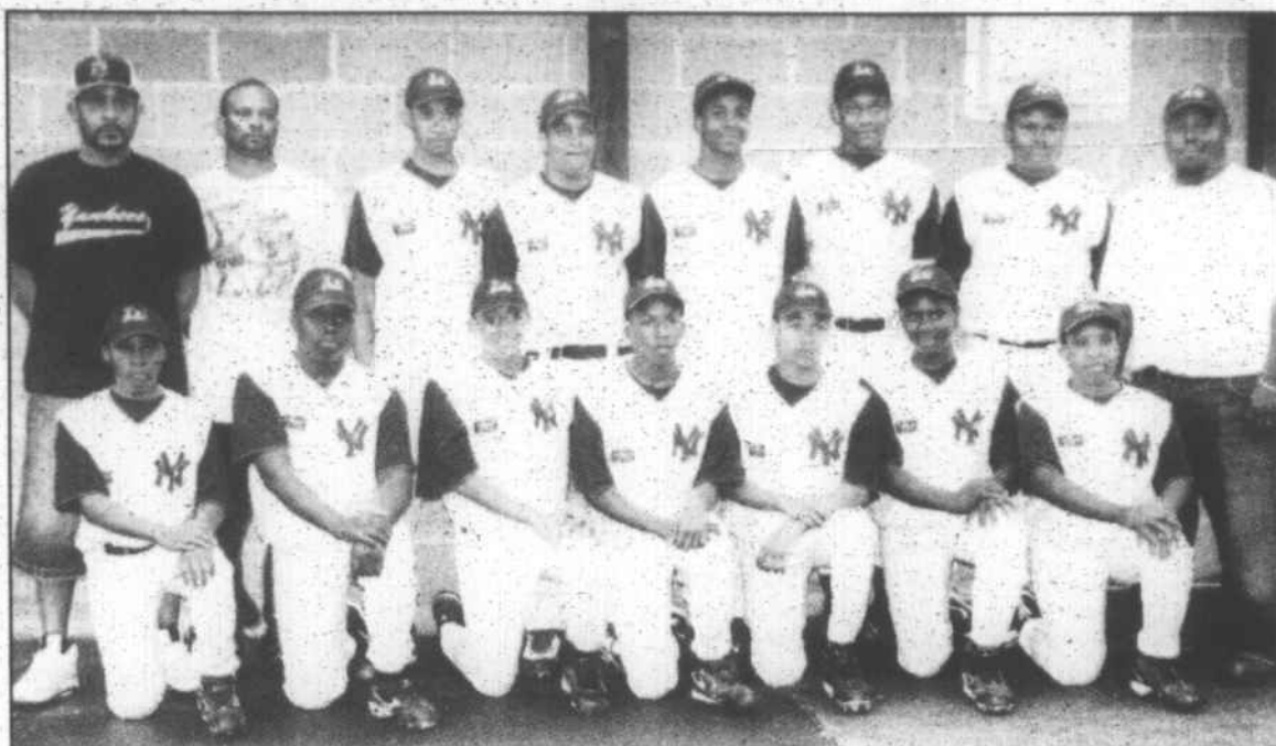
Yankees players and team leaders.