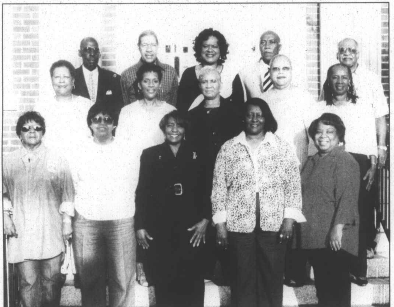
In keeping with its commitment to give back to the community, the Simon G. Atkins Alumni Association recently made two donations to local organizations. The group presented $2,000 to the Winston Salem Preparatory Academy at Atkins and $500 to the Samaritan Ministries.

WE DON'T JUST PROVIDE FOOD FOR HOMELESS INDIVIDUALS AND FAMILIES.