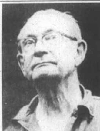
Byron De La Beckwith

The tribute is organized by Evers' brother, Charles, who campaigned for U.S. Sen. Robert Kennedy in New York in 1964 and in the presidential campaign four years later.