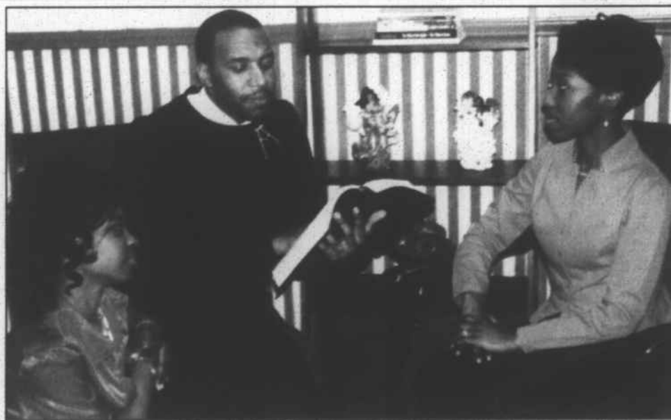
Actors in a scene from the play.