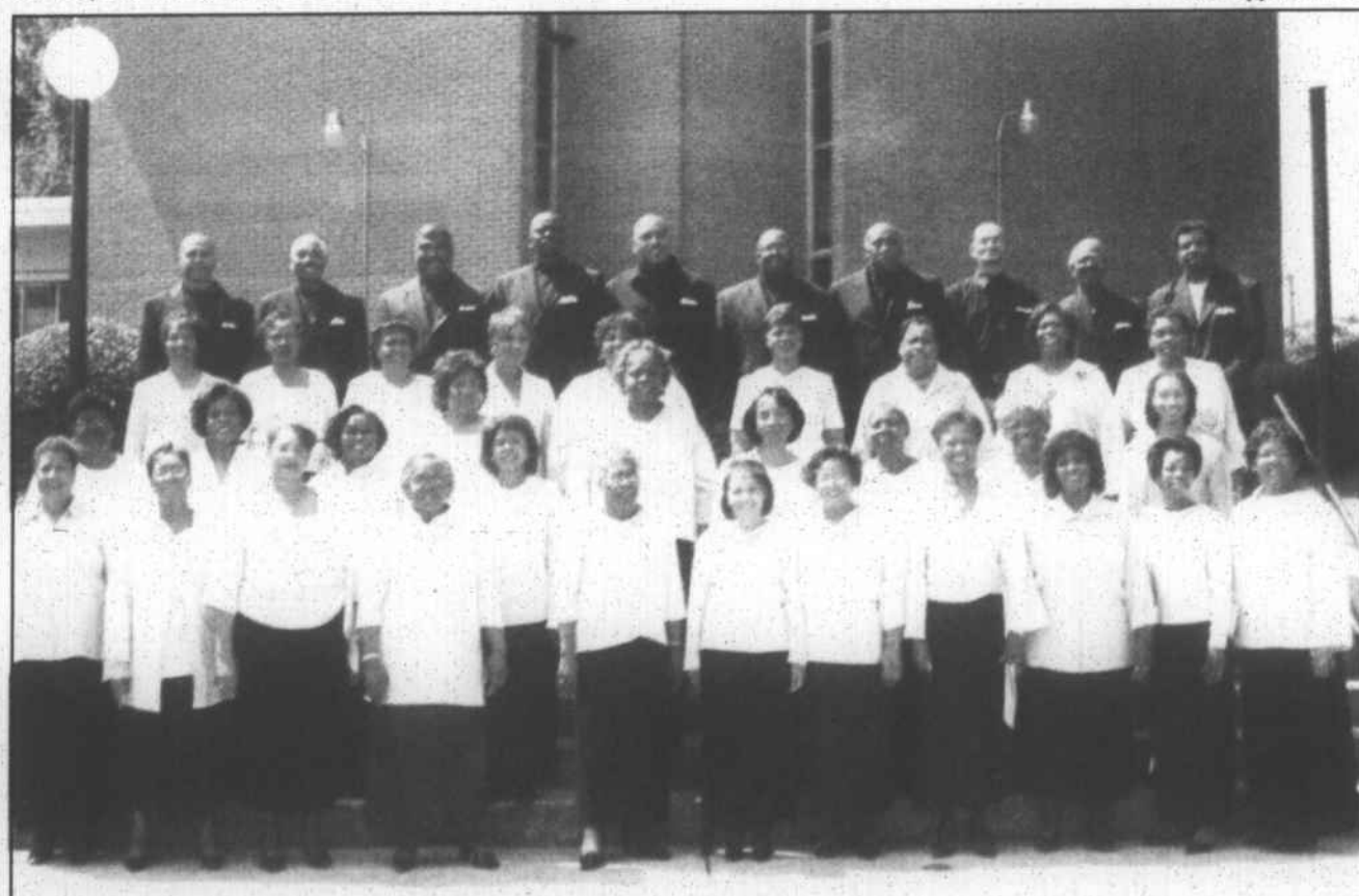
Members of the Inspirational Choir of Mount Zion.

For banquet ticket information, contact Juanita Penn at 336-997-0271 or go to www.ambassadorcathedral.net .