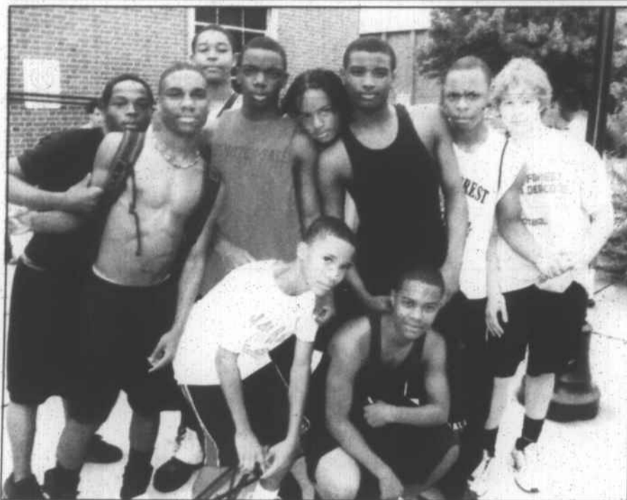
The JV Football Squad.