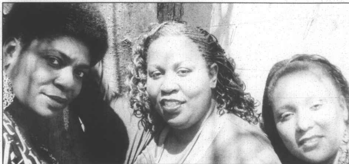
Flow Theater Photo

The show celebrates the power of the female spirit by telling the stories of women who have endured the kind of trails and tribulations that could break people. But these women have survived, developed