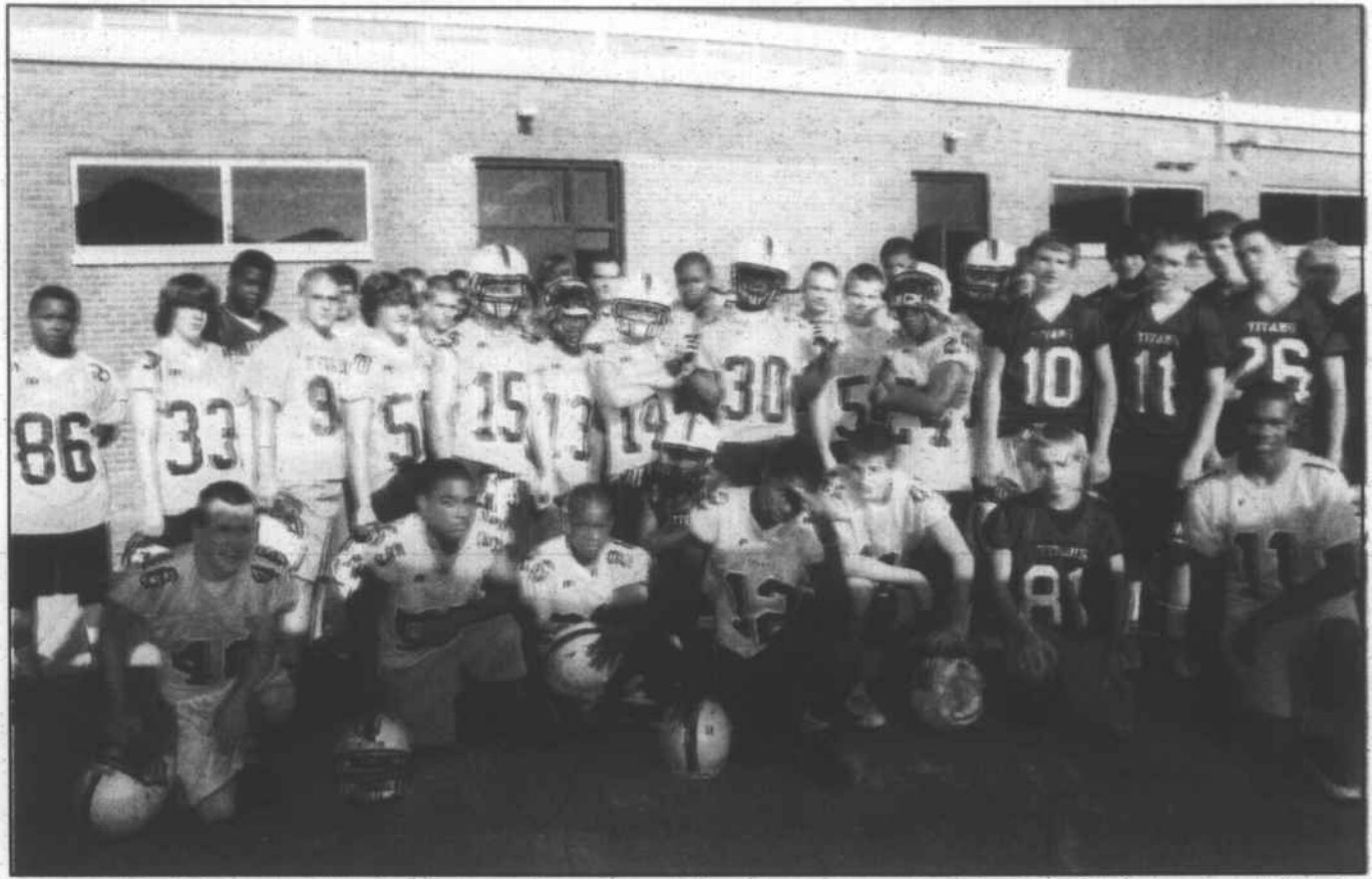
The West Forsyth JV team.