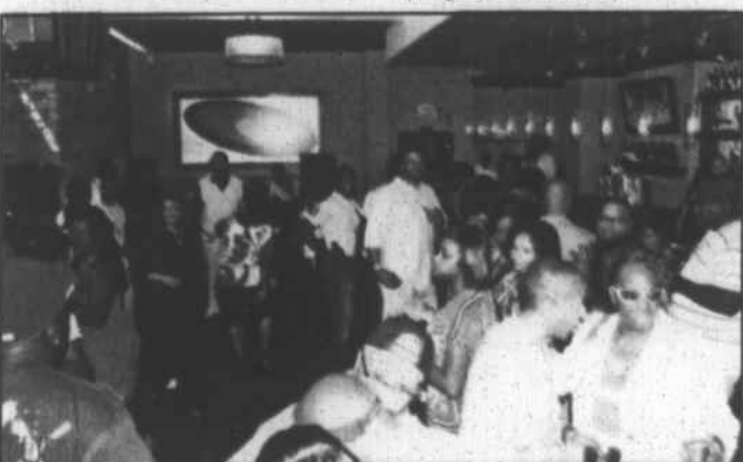
A crowd packs NOMA for the recent NBTF party.