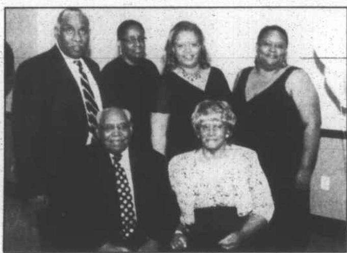
The happy couple poses with loved ones.