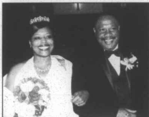
The bride and groom.