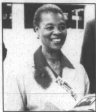
State Rep. Parmon