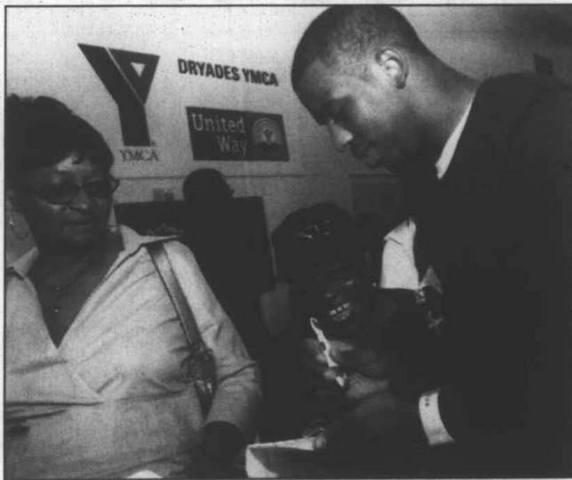
Chris Paul signs autographs for fans in New Orleans.