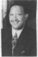
Marc Morial Guest Columnist

On Sept. 9, before a joint session of Congress, President Obama made his most detailed and impassioned case to date in support of legislation to fix our broken health care system and at long last make health insurance affordable and accessible to every American.