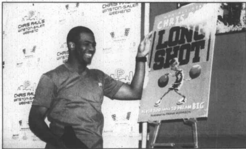
Chris Paul unveils his new book.