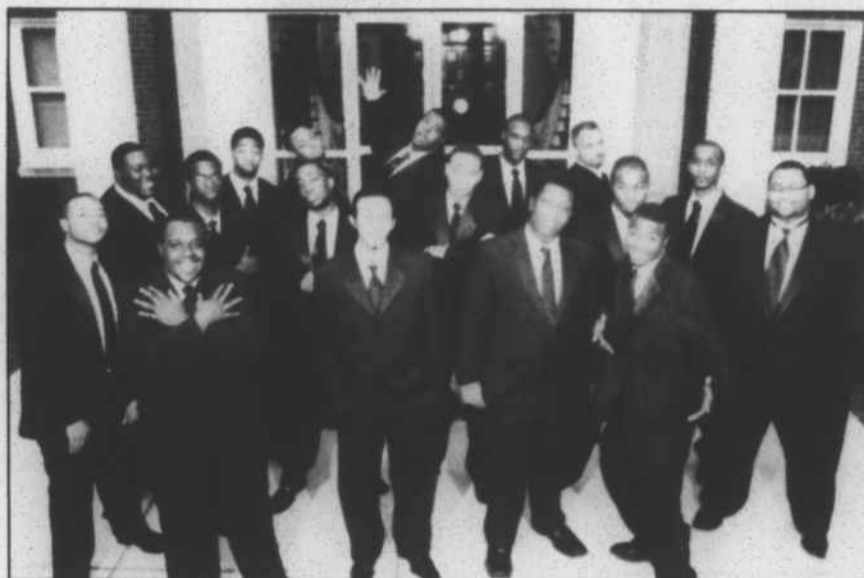
Members of the Winston-Salem State University Men's Ensemble.