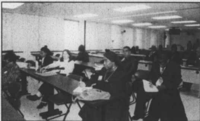
Boot camp attendees listen to Muhammad's remarks.