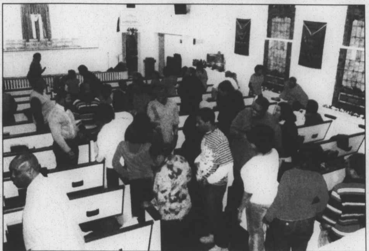
Attendees fellowship during the recent Watch Night service.

For more information about The Potter's House Community Outreach Ministries, visit www.tph-ministriesinc.org