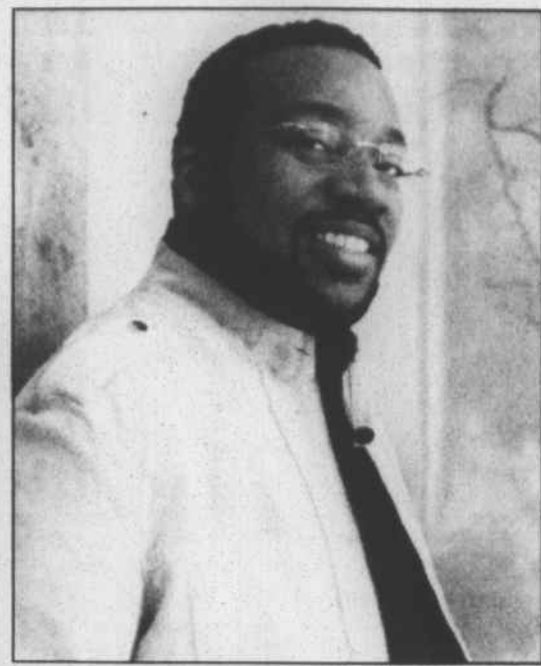
Marvin Sapp was the big winner.