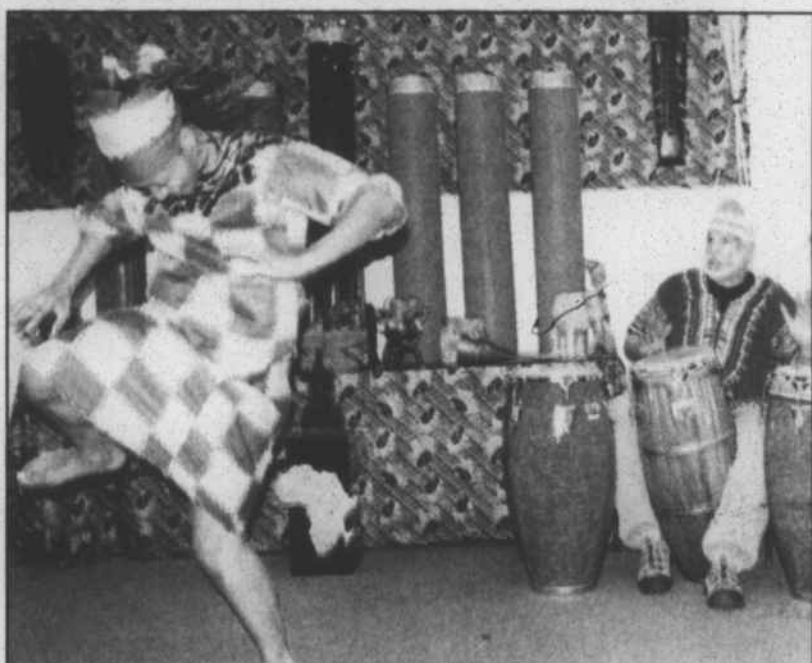
Members of Otesha perform.