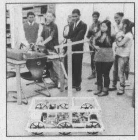
Students have learned the ins and outs of robotics at pre-competition

Team Yellow Jacket is a part of the NC FIRST (For Inspiration and Recognition of Science and Technology) Robotics program, which is supported by JC Penney and NC 4-