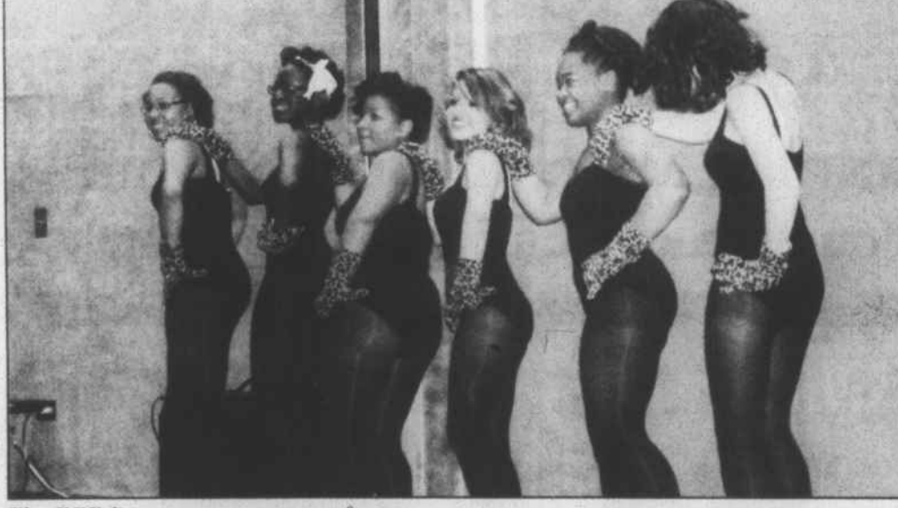
The ECF Dancers prepare to perform.

Supported by the Arts Council of Winston-Salem & Forsyth County