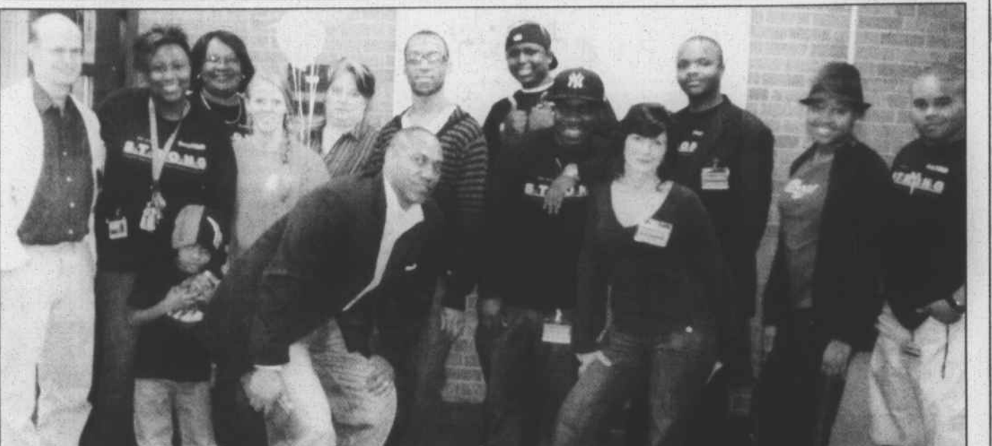
Some Apollo Night performers pose with FTCC administrators and leaders.

Left: Students show how the robot works.