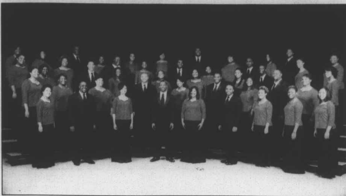
The WSSU University Choir