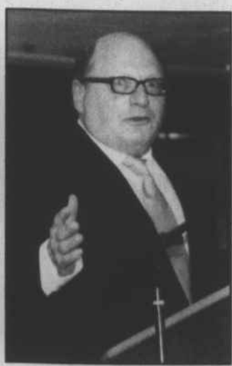
Oscar Hijuelos speaks.