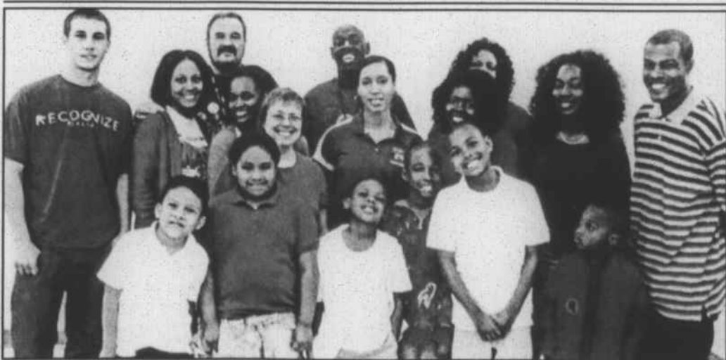
The WSSU team poses with Hanes Hosiery leaders and some of the kids.