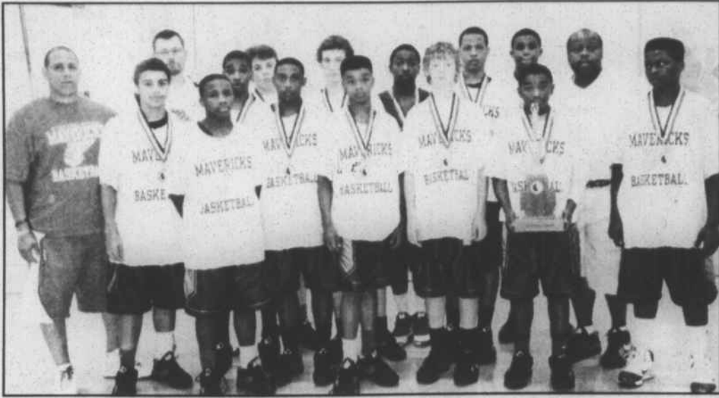
Members of the team with their coaches.