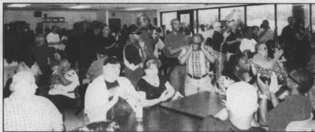
Workers take a break for the 75th anniversary celebration.