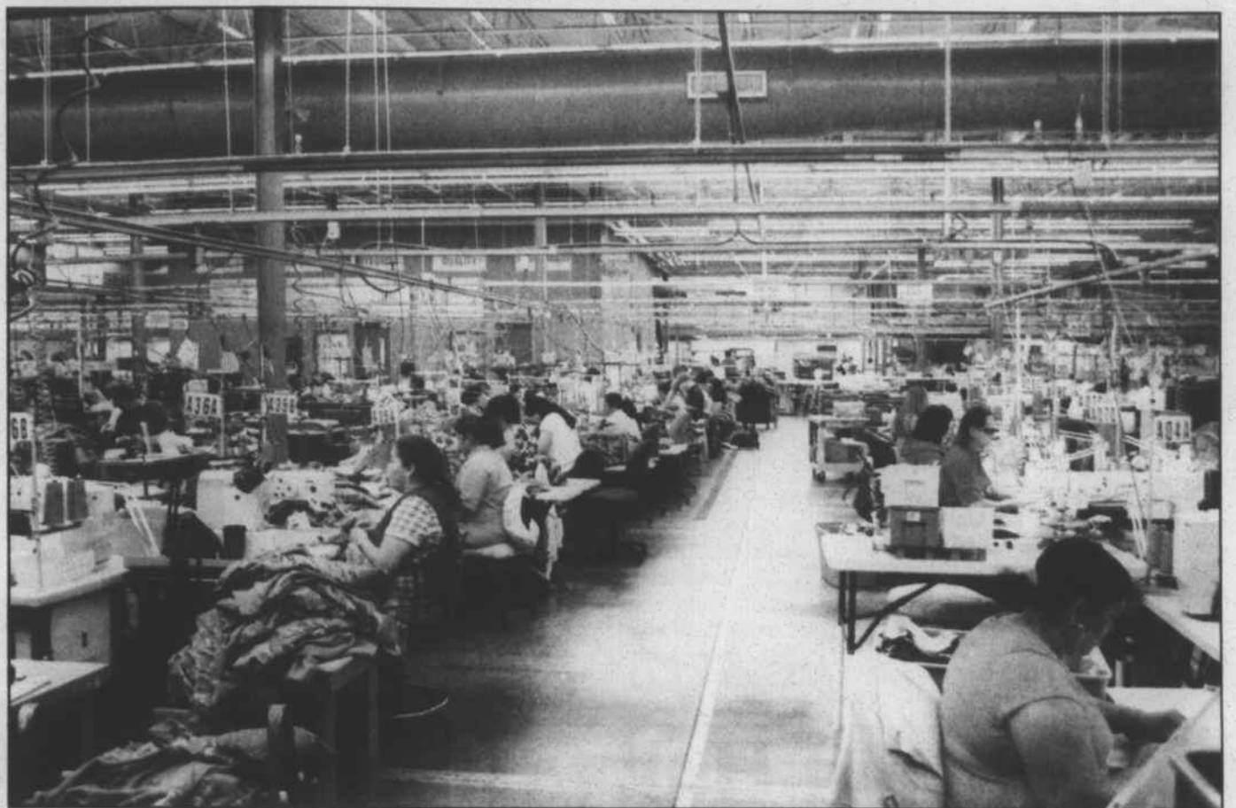
Employees make military clothing at Winston-Salem Industries for the Blind.

That night, the baseball theme continued at BB&T Ballpark. Before The Dash game, the crowd witnessed a