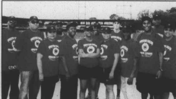
The Urban League Smashers