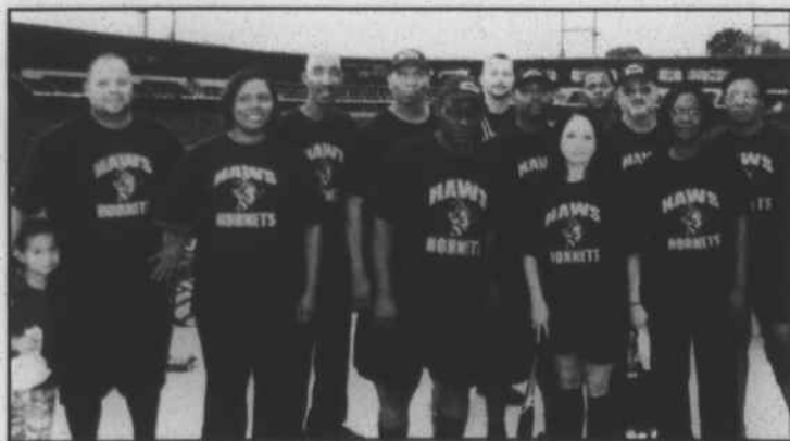
The HAWS Hornets