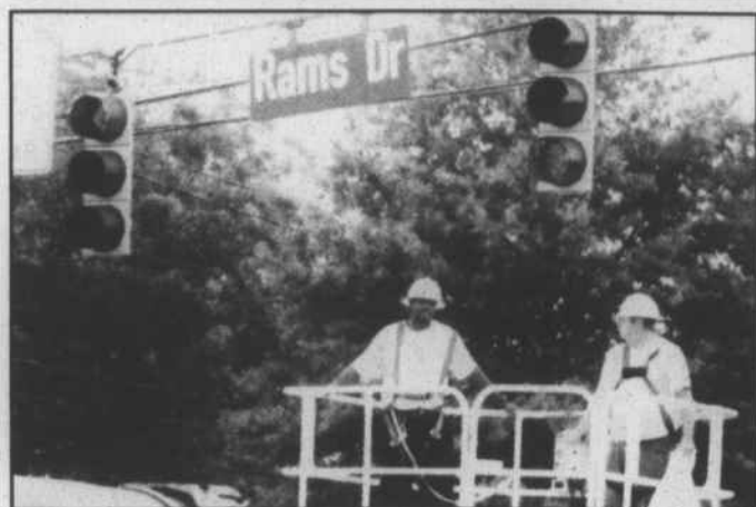
City workers unveil the new permanent street sign.