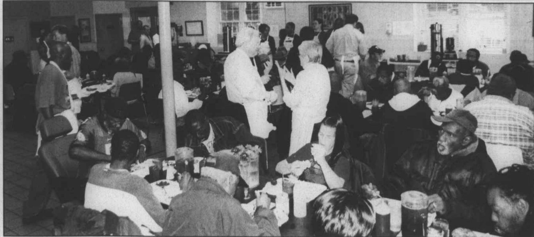
Locals eat lunch at the Samaritan Ministries Soup Kitchen.

Disabled American Veterans (DAV) Auxillary Chapter #9 will host a free outreach program to inform veterans and their families of the benefits and services they are entitled to. National Service Officers will be on site and refreshments will be served. It will be held on Thursday, Oct. 27 from 7 - 9 p.m. at American Legion Post #55, 111 Miller St.