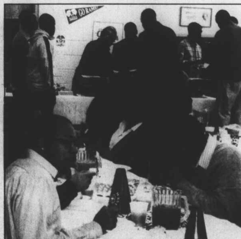
Students enjoy the post-service meal.