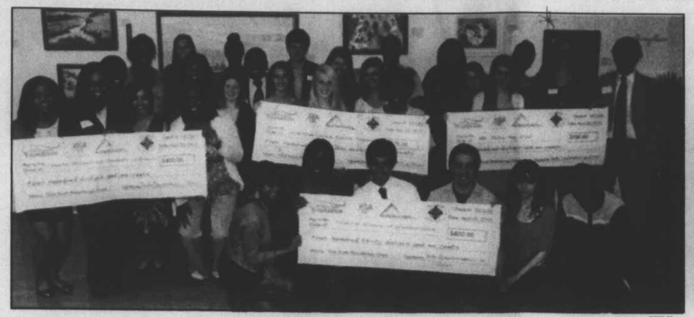
YGA members and grantees pose with oversized checks.