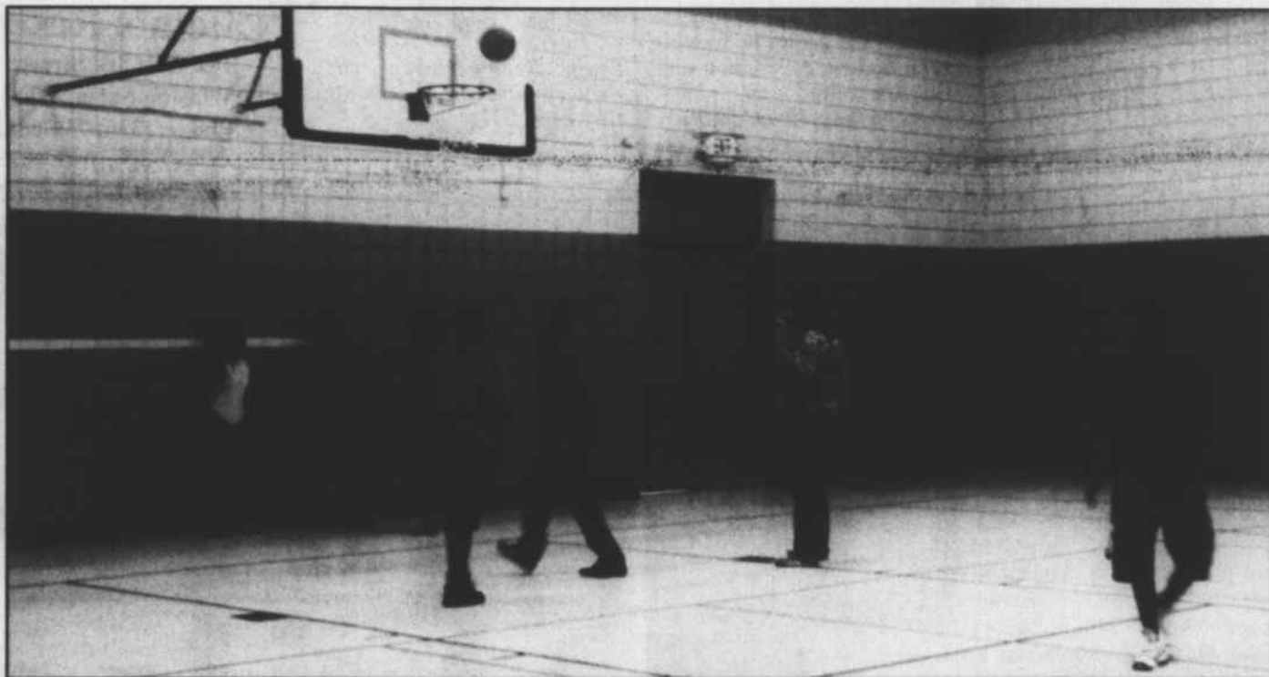
Above: Teen ballers enjoy Teen Night at Polo Park.