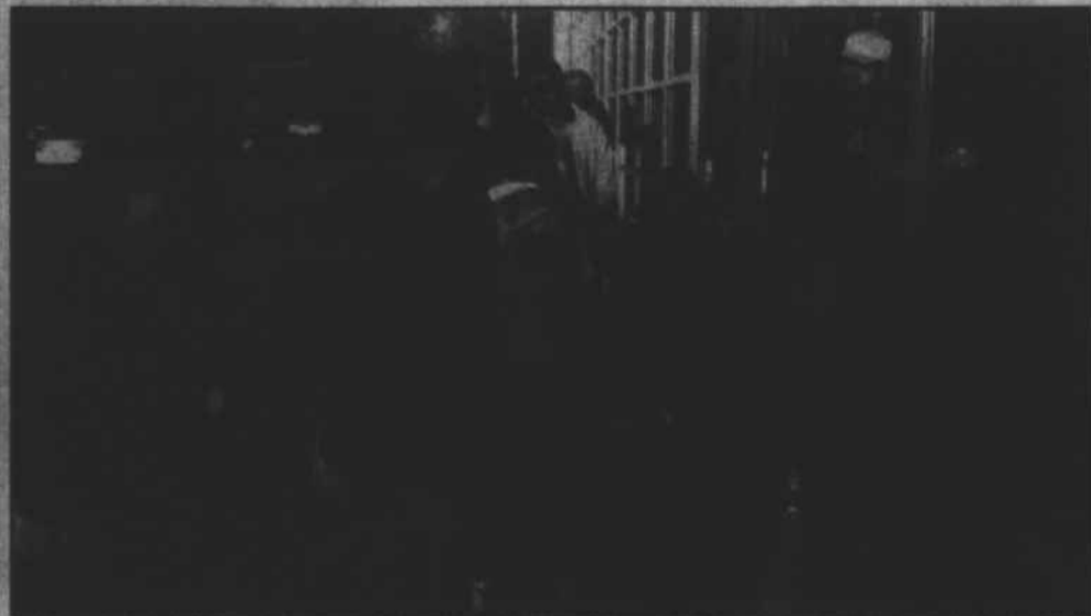
Above: Children rush into the store to take part in the shopping spree.