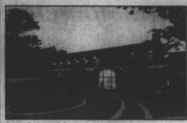
A rendering of the new structure.

School officials say that the new facility will showcase the vibrant campus and act as a hub for student activ-