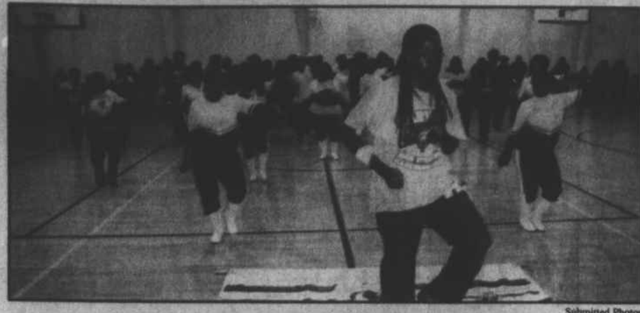
The Carver High School Marching Band makes some noise.