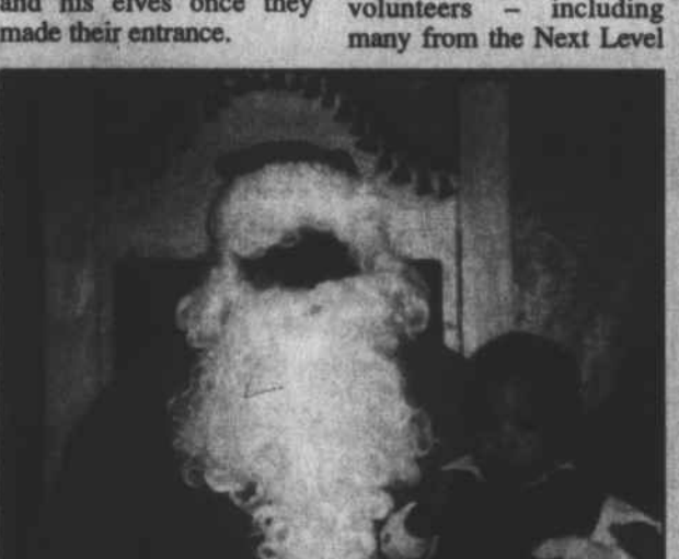
Santa poses with one of his smallest admirers.

Next Level Track Club was the event's co-sponsor, along with the City of Winston-Salem's Recreation & Parks Department. Dozens of volunteers - including