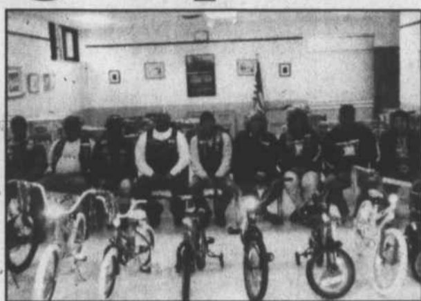
Members of the Carolina Cruisers Motorcycle Club pose with some of the bikes they donated.