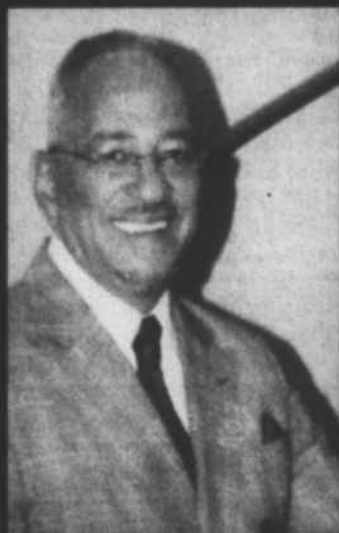
REV. JEREMIAH WRIGHT

Awards Banquet Honoring the 2013 Award Recipients Saturday March 23rd at 6:00 p.m. Benton Convention Center Call 336-722-8624 for tickets