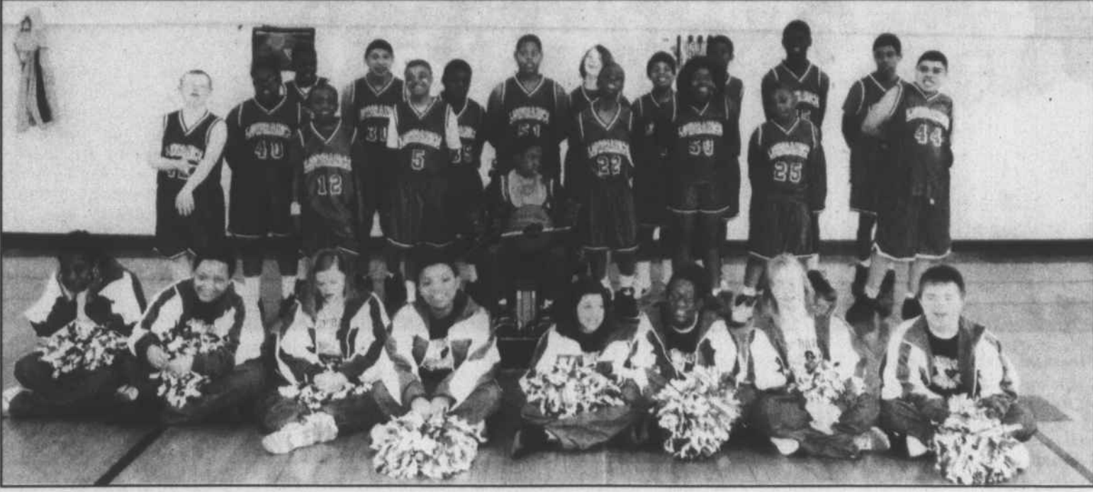
Lowrance Middle School's basketball team and cheer squad pose before the big game.