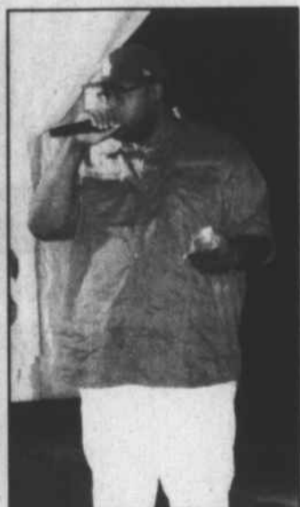
Awardee Robb County