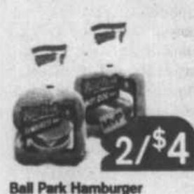
8 Ct. - 12 Oz.