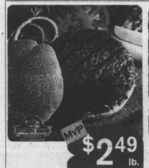
73% Lean Ground Beef Value Pack