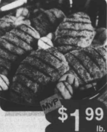
Boneless Chicken Breast Value Pack