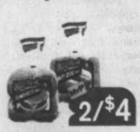
or Hot Dog Buns