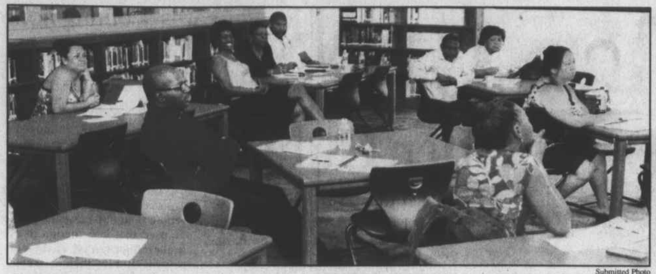
Parents listen to a speaker.