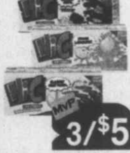
10-Pack Hi-C 6.75 Oz. Boxes - Select Varieties