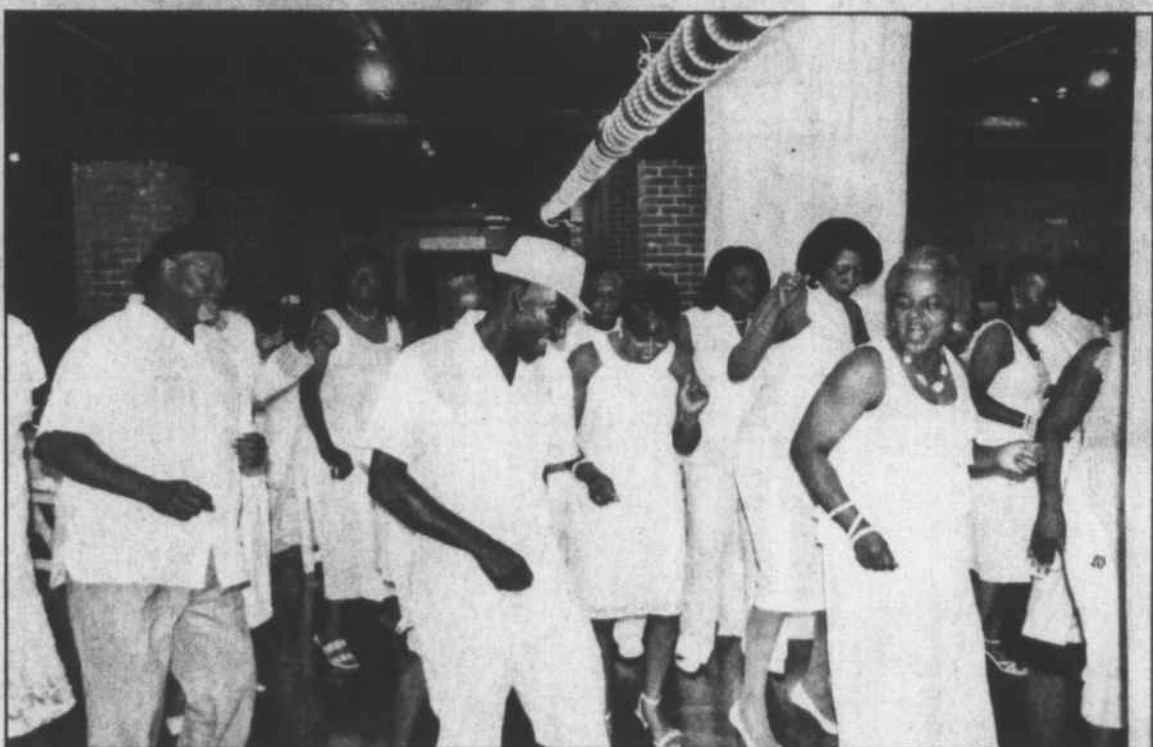
Attendees take to the dance floor at the Atkins Class of 1971's gala last week.