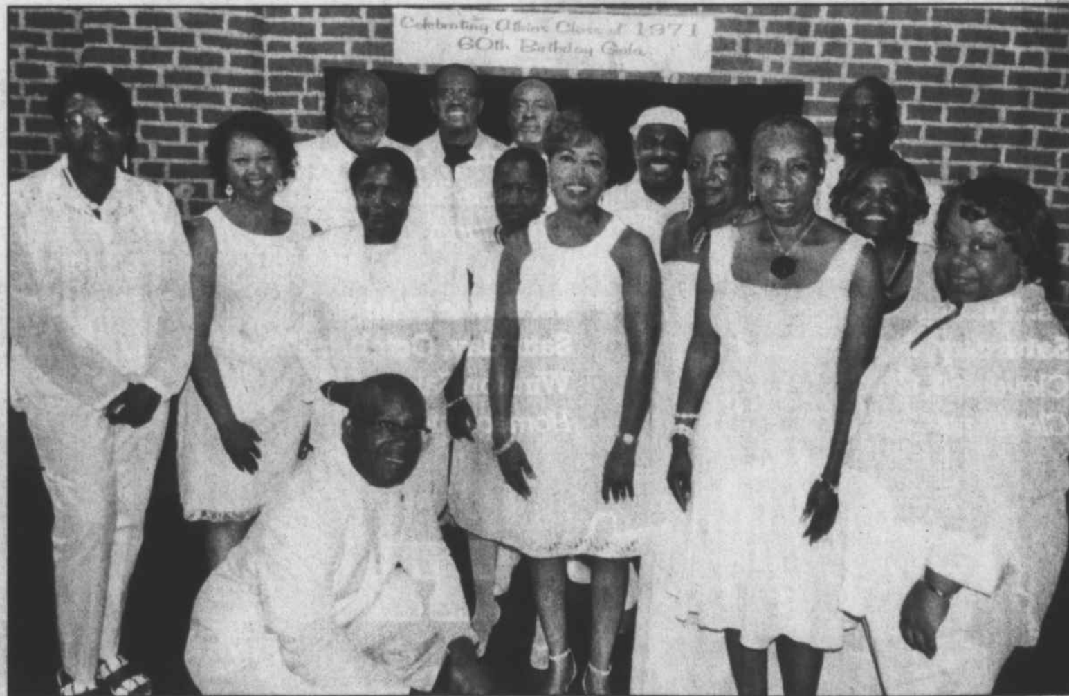
Members of the Class of 1971 pose for a group shot.